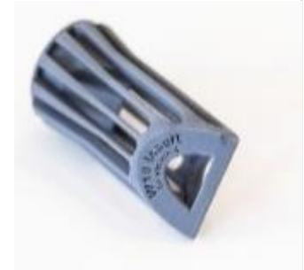
Jigs & Fixtures