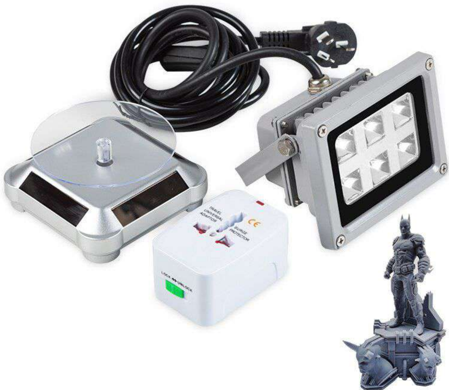
UV Curing Light

Short curing time and quick to cure model