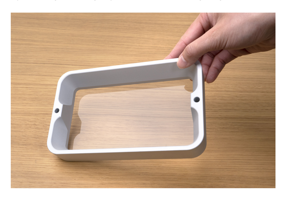
Tip: Try increasing the lift height by 1 mm when encountering a slight loss of tension.